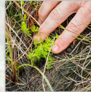
Push the plug into the hole with the capitula above ground

Place/push the plug into the hole leaving only the live capitula heads (vivid green and, sometimes, other colours) sticking out of the ground. If too much of the stems is sticking out, the plants will fall over with an increased risk of drying out.