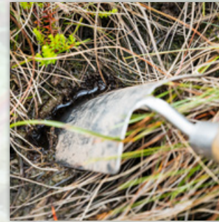
Make a hole deep and wide enough to fit the plug

Once you have identified a suitable location (micro-habitat), break the surface of the peat and make a hole deep and wide enough to fit in the plug (please note there will be some small variations in size). This can be done using different tools, such as a gardener's trowel, dibber, screwdriver, broom handle or thumb.