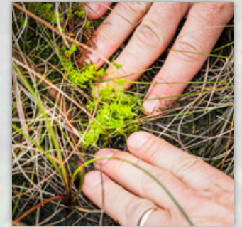
Plug being firmed in to secure the plug

Pinch or push the peat back to secure the plug into the ground. This is essential to ensure that the plug remains in place.