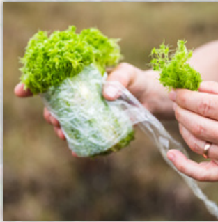
A plug being unwrapped from the bundle

Hold the bundle the right way up (vivid green capitula on top). Unroll until you get to the first plug. This allows you to look at the size of the plug to assess the size of hole needed.