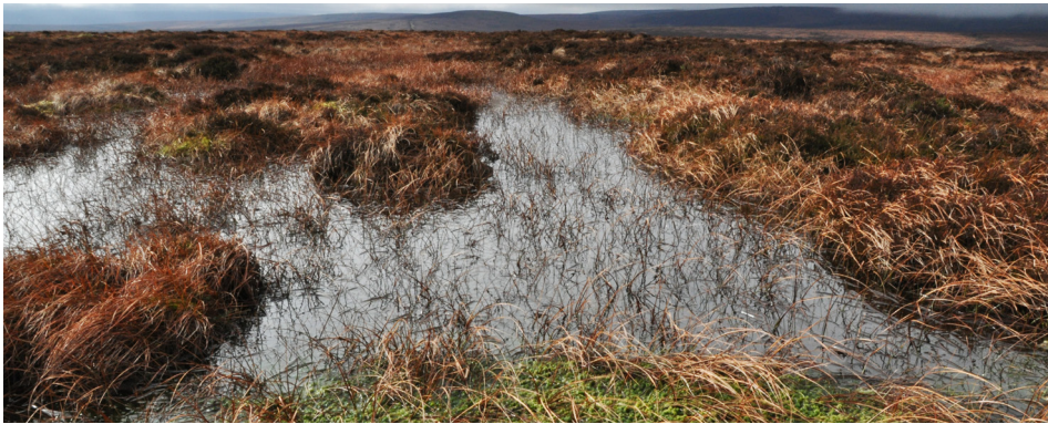
Photo showing healthy blanket bog

The project has key benefits for communities on both sides of the Pennines in terms of improved landscape, water quality and diversity of upland fauna and flora. The blanket bogs are home to many important birds including the endangered twite, curlew and golden plover. Peat-forming Sphagnum moss, which has nearly disappeared from this area due to industrial pollution and wildfires, and other key upland plants - heather, cottongrass, bilberry, crowberry, cloudberry and cross leaved heath – has been re-introduced.