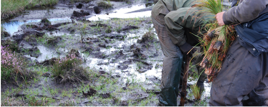
Photo showing cottongrass plugs being planted out

The £5.5 million EU LIFE+ MoorLIFE project is a key part of the initiative. Its primary objective is to restore habitats of European significance – protecting active blanket bog by restoring bare and eroding peat. In just five years, more than 2,000 acres of Peak District and South Pennine moorland has been restored.