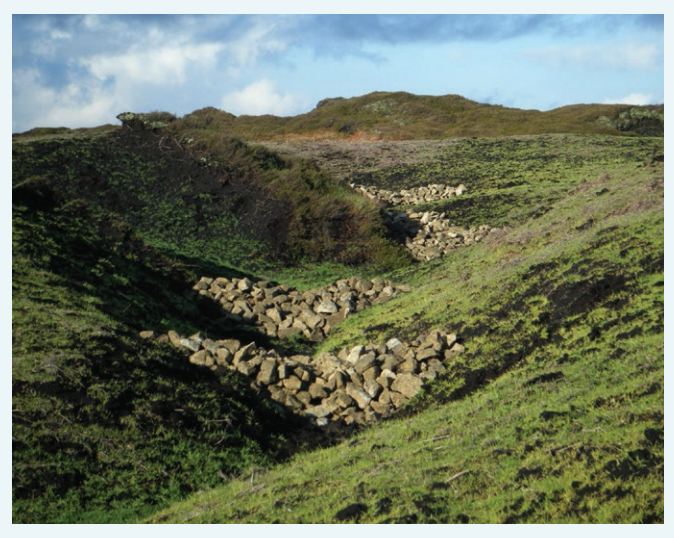
Stone gully blocks and early stage re-vegetation (Derbyshire project)

It can be shown that the total value of the flood risk reduction and other benefits arising from these projects substantially outweigh the total costs involved in implementation.