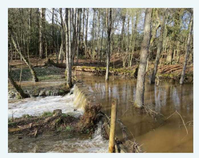
A woody dam (North Yorkshire project)