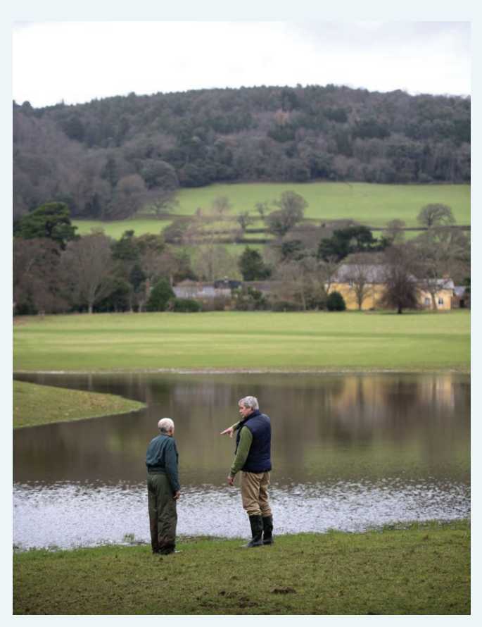
A flood storage area (Somerset project)

NFM impacts cannot therefore at present be evaluated in the purely quantitative way we might assess an engineering intervention.