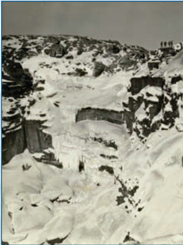
A snow covered Kinder in the 1950s

run back to the handler, indicate by barking, ... go back to the casualty, come back to the handler bark again, go back to the casualty and they keep shuttling until the handler gets to the casualty.”