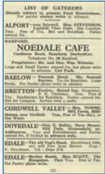
Page from a Clarion Ramblers' Handbook advertising places where walkers could get afternoon tea