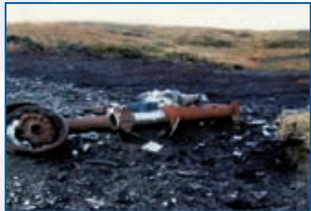
Remains of wartime plane crash

down and I said well it's difficult because they're in New Mills. So we contacted them and they came ... the crew were all Canadians, six of them and they laid them out here in these garages, here at the Royal Hotel [Hayfield], ... they brought them down the next day. No [none survived] ..." He goes on, "And on that area where the bypass comes down there was an ammunition dump there, a big curved building ... where the Home Guard kept all their ammunition and things. Where we are here, all the bombing in Manchester you could see what was happening ... it was Christmas time when Manchester had it's Blitz, ... I was up ... Highgate Road, ... [saw] taxi, with a trailer behind it with bits of furniture and they'd been bombed out of Manchester and fortunately they'd had some relatives ... lived at Stones Edge ... [they were] people coming out of the blitz. And some of them still stayed while others moved on."