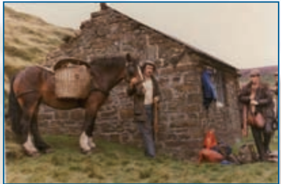
Shooting Party at Oyster Clough Cabin

The shooting parties were out on the moors all day but stopped for lunch at the shooting cabins or gamekeeper's lodge. Maureen Armes recalls helping at the Waggon and Horses public house in Langsett which provided food for the Pilkington family shoots. As Maureen says, "When I