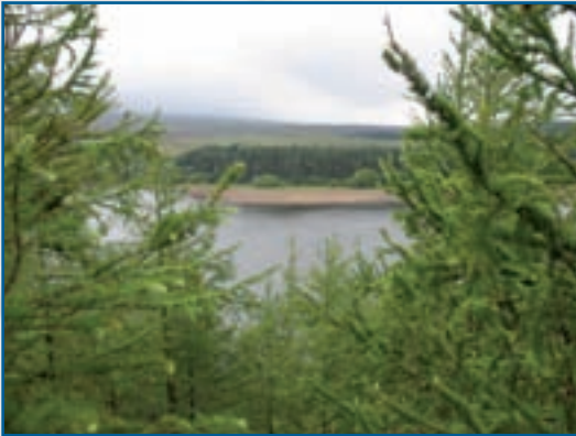
Plantations around Midhope Reservoir, August 2011