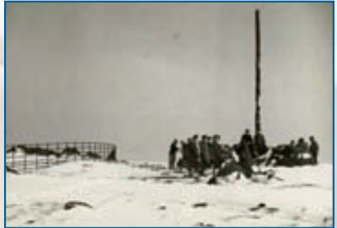
Clarion Ramblers at Stanage Pole in the 1950s