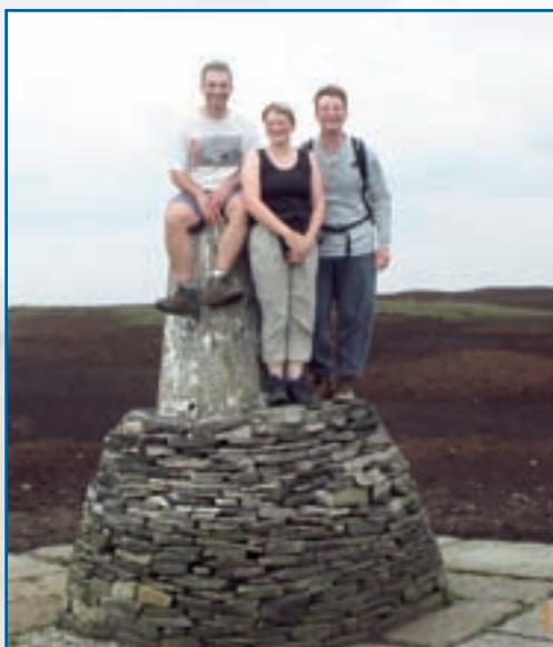
Black Hill trig point 2003