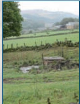
Site of old well used for drinking water

The villages of Ashopton and Derwent were demolished when the Ladybower reservoir was built in the late 1930s and early 1940s. George Townsend, was born in 1929 at Rose Cottage, “Ashopton was very quiet during the week and hardly anyone had a car ... fairly busy on Sundays in the summer with bicycles, a few mollymorgans (two wheels at the front and one chain driven wheel at the back) and a few motorbikes. There were two shops ... a post office, Ashopton Inn, two petrol pumps and a joiner’s shop ... a Methodist chapel, .. stained glass window is now in the Hope Sunday School. Joel Marshall worked ... making carts, at the joiners shop, making coffins etc. ... no tractors, all horsepower. I remember a steam lorry one day bringing beers to Ashopton Inn. There was a bus service to Sheffield. The butcher came once a week, he was called Percy Law. Hancocks from Bamford brought orders, groceries etc. round every week. There weren’t many telephones, no electricity, there was a phone box. We had a wireless which not many people had. My father and mother used to make teas for people on Sundays. One man used to come every Sunday, wet or fine, he had two eggs, two boiled eggs. We had our milk from Tonbridge at Jackend Farm.” The family moved to a small-holding at Thornhill in 1939.