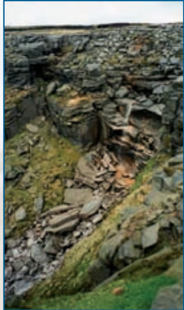
Kinder Downfall