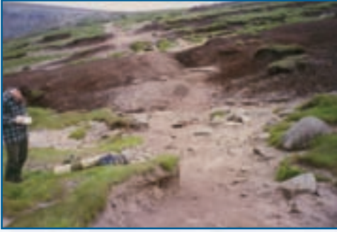
Monitoring the footpath erosion © Moors for the Future Partnership.