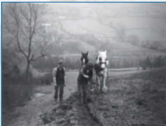
Mending the footpath after ploughing

who moved to his farm in 1949, also recalls, “Clough House was a typical hill farm. It’s 80% moorland and rough grazing and 20% pasture, meadow land. [We] used to be paid a government subsidy to have cattle to graze the hills, ... it was £3 per head from the period