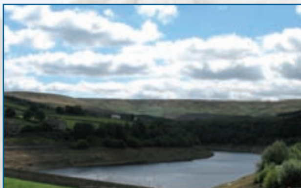
Brownhill Reservoir, Holme Valley

empty the weirs ... [we'd] walk from here [Brownhill reservoir] up to Ramsden ... taking some of the tools with us; ...we had some of the tools up top end like [on the moor] set off ... eight o'clock in the morn- ing, twelve o'clock lunchtime, half past