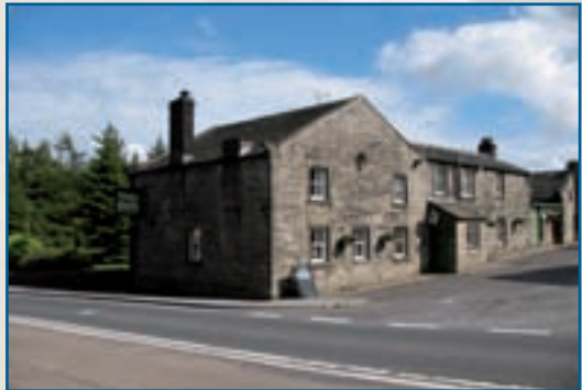
Waggon & Horses public house, Langsett

Cellar must have been good, kept beer absolutely perfect. ... go for a pint of hand-pulled Tetleys, it was the finest ... would look at each other and say 'that's good'... it was like walking back into time ... Friday night it would be absolutely packed.”