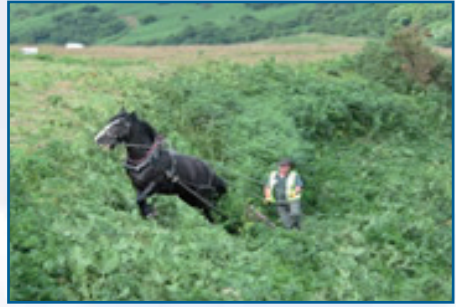
Moorland management

[the] cattle ate it ... was poisonous to 'em. But for horse[s] it was very good ... used to see some good beds of bracken up there [Stanage] ... couldn't cut it every year ... weakened it. You'd cut it about every third year, but in a different place each year ... get the permission of the gamekeepers to go on their patch."