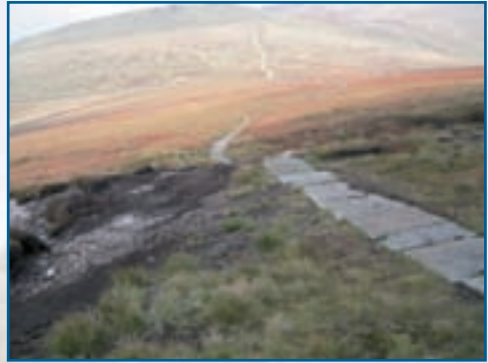
Moorland restoration with a flagged path