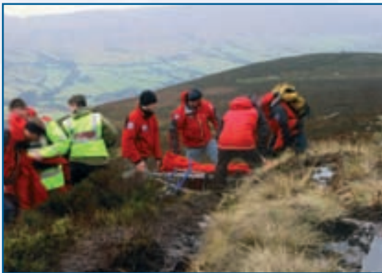
One of the rescue teams on exercise

Now they can ring largely ... because not all of our moorlands are covered by a mobile phone network. Also there is a downside where people think, well if I get into trouble I'll just call 999 and ask for mountain rescue and they'll come sort me out, so people that may not be equipped both physically with their equipment and mentally to cope with situations are going into areas that perhaps they shouldn't or wouldn't have done prior." [BEWARE not all our moorlands are covered by a mobile phone network.]