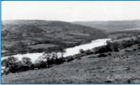
An old farming landscape looking over to Broomhead Moor