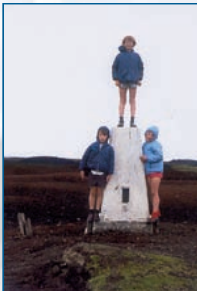
Black Hill trig point 1976