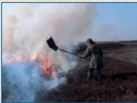
Using a fire broom on controlled moorland burning © photograph Moors for the Future Partnership.

Gamekeepers aim to create a patchwork of heather stands of different ages where the grouse can feed, nest and shelter. Roger France, a gamekeeper in the Glossop area, says, “ [there is a] need to manage the heather, .. done over a fifteen year cycle using controlled burning .. undertaken between October and April when ground is damp ... enables the fire to “skim” over the soil surface leaving seeds and roots unaffected.” John Littlewood describes the burning in more detail, “ ... anything from 50m by 25m but usually 25m by 100 to 150m at one time depending on [the] area. First thing was to pick the