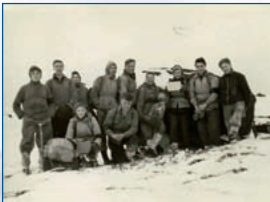
Clarion Ramblers' Rescue Training Exercise on Kinder in the 1950s