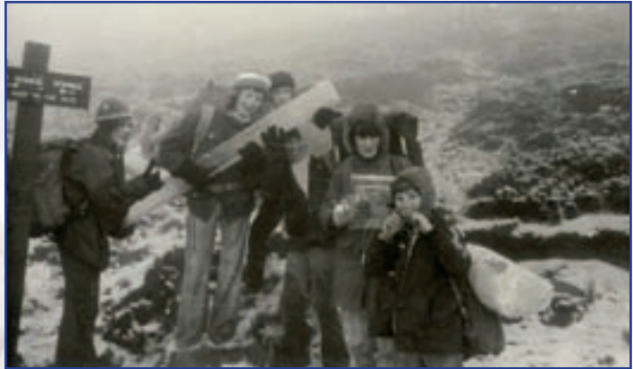
Party of teenagers from the Woodcraft Folk in the 1970s