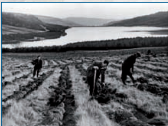
Planting trees on Broomhead Moor

Many of the men interviewed started life working on farms but later worked as contractors or hauliers for the farming communities and rural industries in general. Others became waterboard workers, foresters, quarrymen and miners.