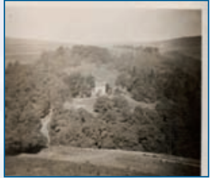
Agden House and woodland in the 1920s