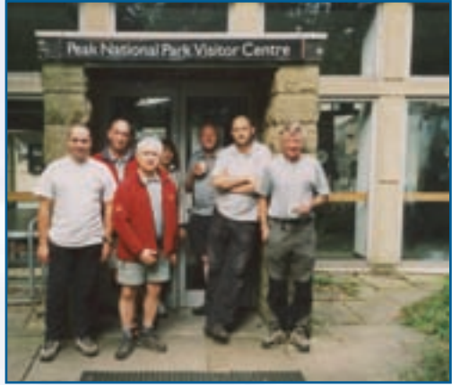
Rangers outside the visitor centre in Edale

[and] I was keen on the outdoors. ... just wanted to give something back ... and I applied. I mean there was no course ... all you did was go to Bakewell and you sat there and they asked you a few questions."