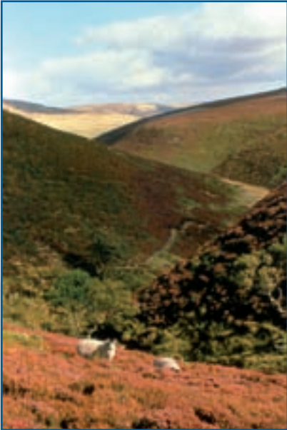
Moorland view

The information in this booklet covers the moors within the Peak District National Park and its fringes. It includes Wildboarclough in the southwest; Hathersage and the Longshaw estate; the Dark Peak area; and Holme Moss and Black Hill to the north.