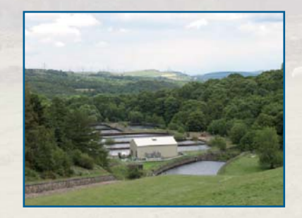
Langsett treatment works.

There have been changes since the reservoirs were built. Only traces of the 'tin towns', railway tracks and workshops now remain. The original treatment works have been replaced by newer modern facilities. Old filter beds