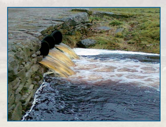
Brown-tinged 'peaty' water, known locally as 'Langsett Tea'.