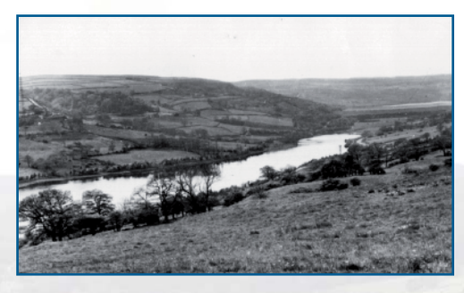
Farmung landscape before forestry plantations.

Strines, Dale Dyke, and Damflask), Ewden valley (Broomhead and More Hall) and Little Don valley (Langsett, Underbank and Midhope) either for drinking water or to create 'compensation' flows of water which the heavy industries along the River Don needed. This resulted in nine reservoirs being built which flooded farms, track ways, corn (grist) mills and other buildings in the process. These large expanses of water created an attractive lakelandtype landscape. Dam walls, valve towers, overflows, filter beds and treatment works were built as part of the reservoir structures.