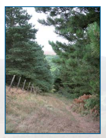
Old farm track leading to the moor.

The reservoirs, earth embankment dams, water overflows, treatment works and valve towers are the most visible and obvious signs of the water industry in the area. However, the whole of the moors both above and below ground play their part in providing a drinking water supply for part of South Yorkshire. These moors were known as the 'gathering grounds', or 'catchment areas' where the water which falls onto the moor is collected and channelled into the reservoir. The provision of drinking water was originally the responsibility of private companies until the Barnsley and Sheffield Corporation Water Boards took over. They employed teams of Water Board workers to look after the treatment works and the