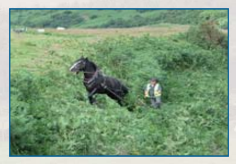
Moorland management.

The day's shooting would start about 8.30 to 9am and finish around 4pm for the beaters, flankers and dog-men. The keepers would have a longer day. As Fred Goddard recalls, once the shooting had finished, he and the other gamekeeper would go back to the lodge to sort the grouse out into brace (pairs) before they went off to market.