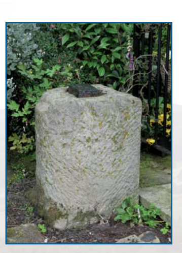
File-cutter's anvil.

File-cutting was one of the traditional industries of the area. It was one of the trades that the parish apprentices (boys) at the Bradfield Workhouse were put to work at in the eighteenth century. Small one-person workshops were dotted about the fringes of the moors around Bradfield, Bolsterstone and Wharncliffe. These workshops were attached to cottages or in farm out-buildings. The file-cutter would receive a batch of 'blanks' (smooth sided files). He would then, using a stone-set anvil (see photgraph), hand chisel the criss-cross lines across the blank to create the finished article. The bundle was then taken back to the