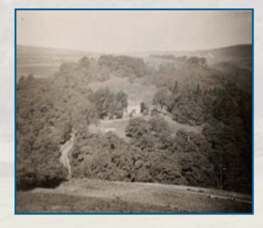
Agden House and woodland.

"Photographs of Agden House show a substantial dwelling (perhaps 300 yrs old) which had a 'ha-ha' in front of it and a yew tree in the corner of the garden. Gamekeepers lived in it until the estate was sold in 1892. The house was demolished in the 1970s as it didn't have mains water and sewerage and the Water Board (Sheffield Corporation) was concerned that the waste from the house would contaminate the reservoir supply. After the last farming family, the Buckleys left, the house was divided into two and lived in by Water Board workers. The yew tree is still there along with a ruined outbuilding which was used as a store by the