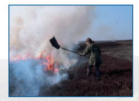
Using a fire broom on controlled moorland burning.

Most of the gamekeepers' time is spent out on the moors. This almost always used to be on foot and the biggest change has come with the introduction of motor vehicles including quad bikes. As John Littlewood recalls,