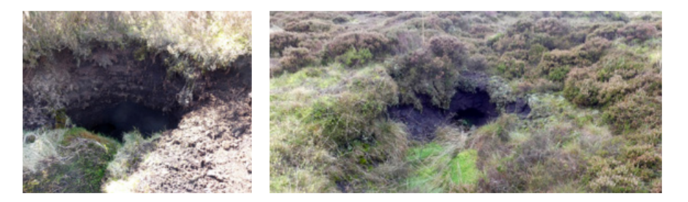
Fig. 2. Photographs of collapsed sections along large, deep mineral-based pipes at Arnfield.

A series of parallel, deep and mineral-based pipes were identified on Arnfield Moor by locating points of collapse that took the form of vertical vent holes or longer collapsed sections leading out of and back into horizontal tunnels ( Fig. 2 ).