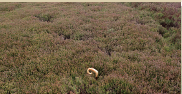
State 3: Dwarf shrub dominated blanket bog Largely inactive, severely modified bogs where dwarf shrub cover exceeds 75% of the canopy and other typical mire species such as bog mosses and even cotton grass are rare or absent. It may have moderate to severe gullying and hagging. Occurs often on 'drier', modified peats and the more easterly moors.