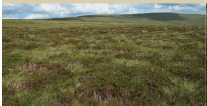
State 5: Modified blanket bog (active) Dwarf shrub cover is high, often reaching 50–75%, and sphagnum cover tends to be lower than in intact blanket bogs. Cotton grass is abundant or frequent as an understorey and becomes dominant in the years following fire. Moderately active, with peat formation likely to be slower than in State 6. It may be drained, but usually with few gullies or haggs. Characteristic of much of the Pennines, for example.