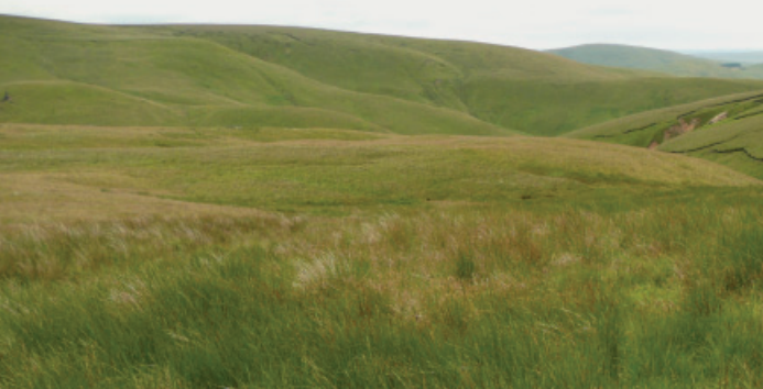
State 4: Grass and/or sedge dominated blanket bog May be active or have potential to become so. Vegetation is dominated by graminoids such as purple moor grass, cotton grass or deer grass with sphagnum bog mosses scarce or absent. This state does not include the post-burn grass or sedge dominated areas of modified bogs of State 5.