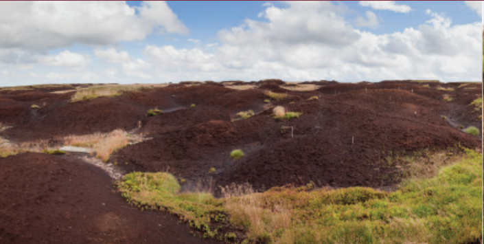
State 2: Bare peat Little or no vegetation with areas of exposed bare peat and extensive gullying and hagging. Unlikely to support representative peatland communities. Small patches of dwarf shrubs (heather) may exist (inactive).