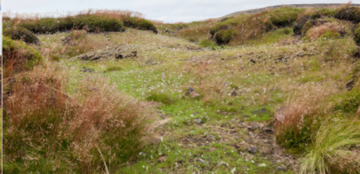
State 2a: Revegetated bare peat Bare peat that has been revegetated. Techniques vary and can include spreading sphagnum-rich heather brash or sowing a crop of fast growing amenity grasses, supported by the application of lime and fertiliser, whose roots bind the peat soil. The amenity grasses will eventually die as the pH drops and the fertiliser is used up.