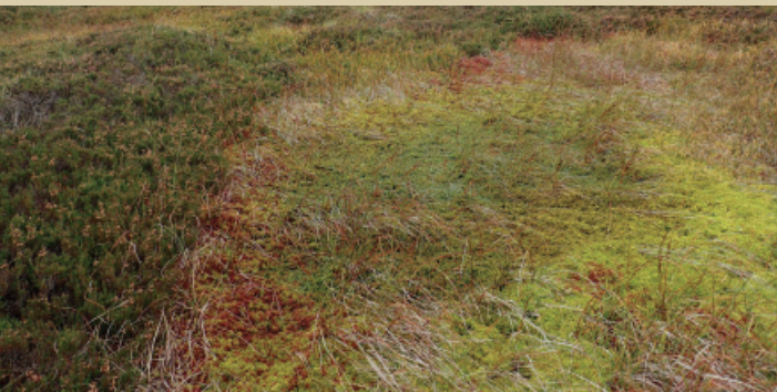
State 6: Active blanket bog This is unmodified or little modified, sphagnum-rich blanket bog, which is peat-forming (active) often with hummocks and hollows. There may be basin or valley mire components. Typically neither heather nor cotton grass achieve high abundance and there is usually a good sphagnum understorey. It meets, or is close to meeting, favourable condition attributes.