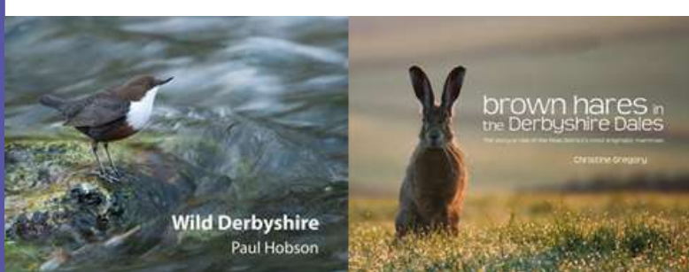
Photo competition 2015

We would like to invite you to take part in this year's photo competition, the theme of which is 'Wildlife and Moorland' .