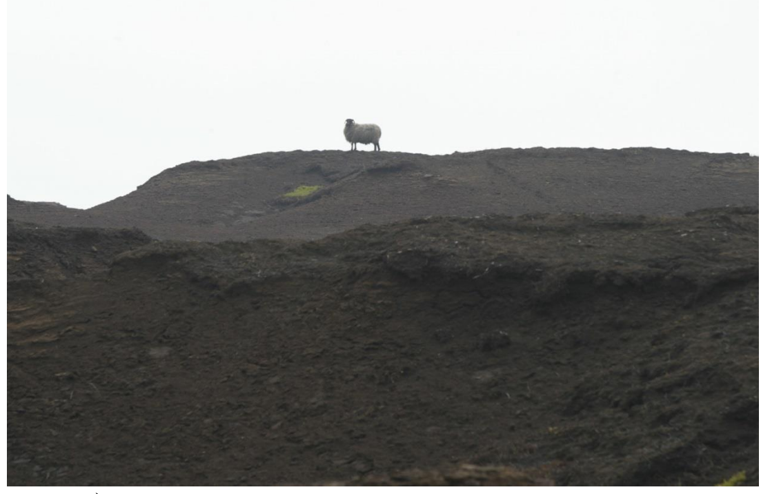
> One common purpose

We set about to bring life back to the moorlands of the Peak District National Park and South Pennies