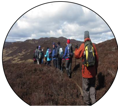
Landscape and access enjoyment