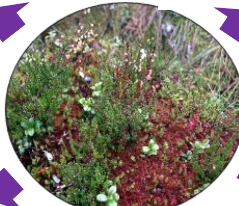
Functioning blanket bog and moorland habitats in favourable condition