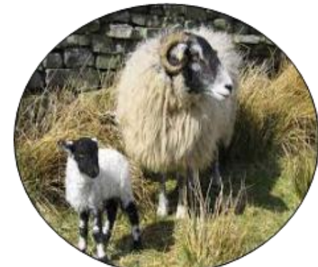
Sustainable upland sheep farming