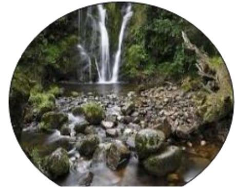
High water quality and flood alleviation