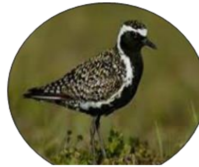
Thriving upland bird populations