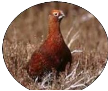
A viable grouse shoot