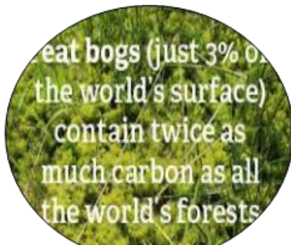
Carbon storage and sequestration