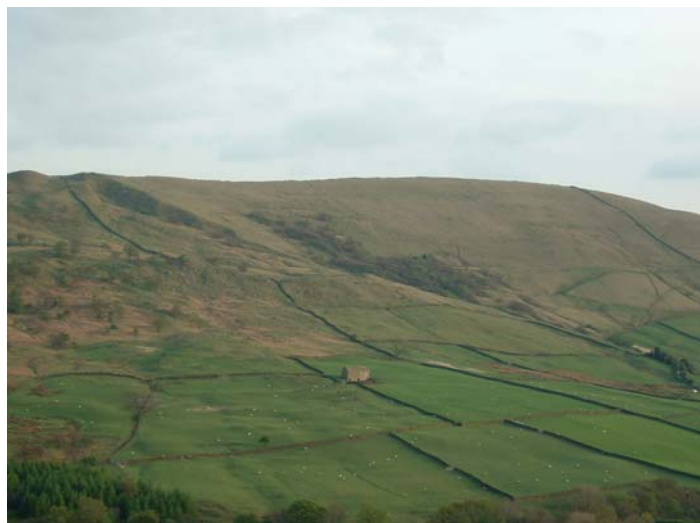
Photo: Changing management and economic incentives are some of the factors which have both created and depleted habitat biodiversity in the Peak District: can hindsight help strike the right balance?

Contact details: ald1@stir.ac.uk http://www.sbes.stir.ac.uk/people/davies.html